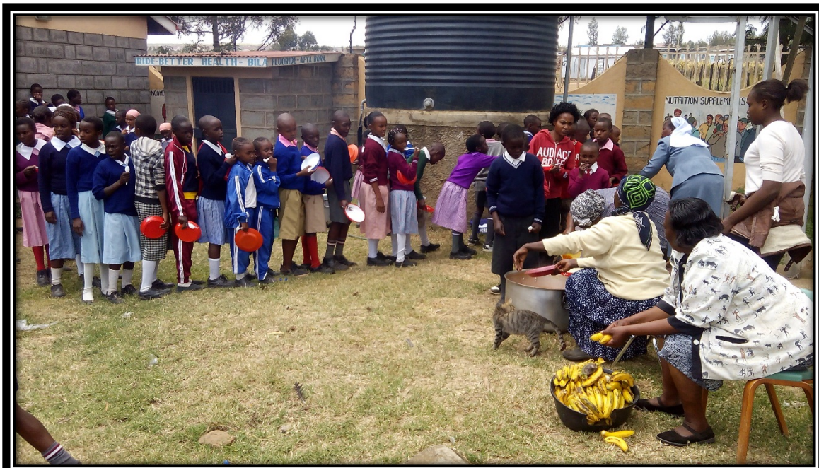
Pupils being served with lunch during academic day