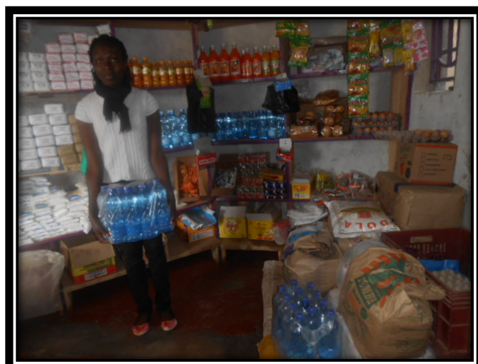
Fountain Valley water selling team (Left) loading empty refill bottles and right a client stocking half liter and 1 liter packs of water in her store ready for sale