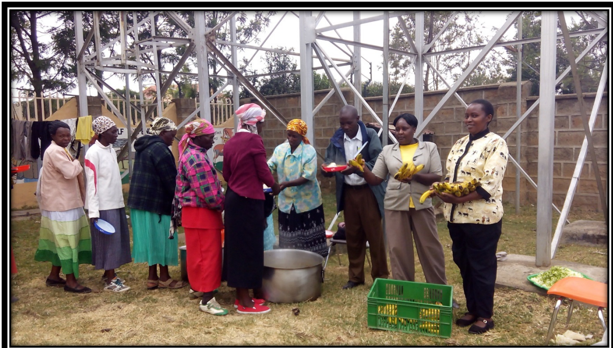
Support group members been served with a well-balanced nutritious food and fruits for lunch