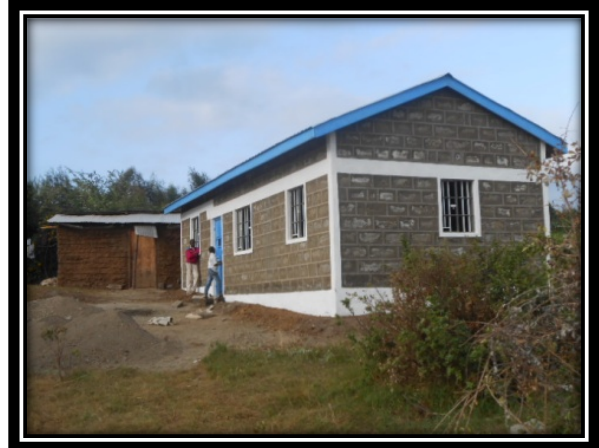
Left: ASN Upendo village staff members visiting the construction site to assess the progress. On right is Hellen's new house