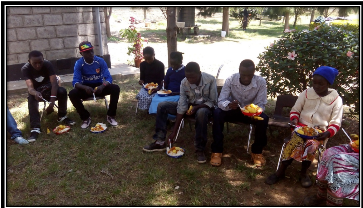
Teenagers taking lunch during kids club (senior) meeting on August 21 st 2015

During the month of August, kids- Club and academic days students are served with a well-balanced diet.