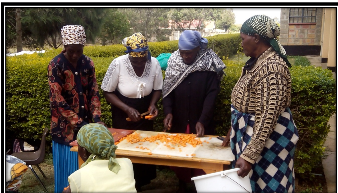
Guardians preparing lunch during kids club meeting on 10 th August 2015

We also had two bedridden clients from Mirera and Karai support group during the period under review but through the provision of the nutrition supplements they are now improving and we are hoping that they will soon be on their feet.